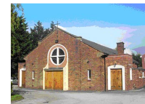
St. Francis, LLAY & Christ The King ROSSETT