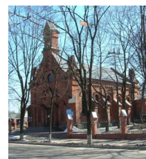
The Annunciation Parish SUMY UKRAINE